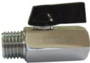
MINI BALL VALVE W/HANDLE

Handle: Black Plastic for handle Or slot crew for w/screw