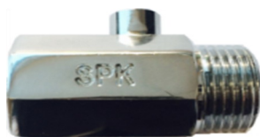
MINI BALL VALVE W/SCREW