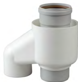
FLU ADAPTOR - TWIN TO COAX CF32C002 This component is required with wall and roof terminals in case of room sealed installation.