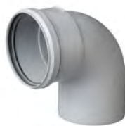
ELBOW 90° CF32T001 ELBOW TWIN 90° 100