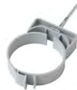
WALL BRACKET CF32T006 Wall bracket is required to secure the flue part to the wall.