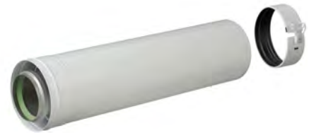
FLUE EXTENSION CF28C005 0.5M COAX 80/125 (CAN BE CUT)