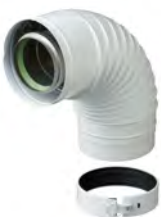
ELBOW 90° CF28C003 COAX 90° 80/125