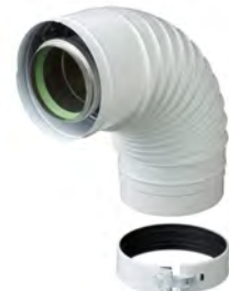
ELBOW 90° COAXIAL 100-150 CF32C003 ELBOW TWIN 90° 100 Only used with wall mounted manifold or unit (wall terminal only)