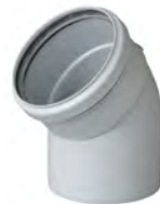
ELBOW 45° CF32T002 ELBOW TWIN 45° 100