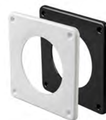
WALL PLATE SET 150 CF32C008